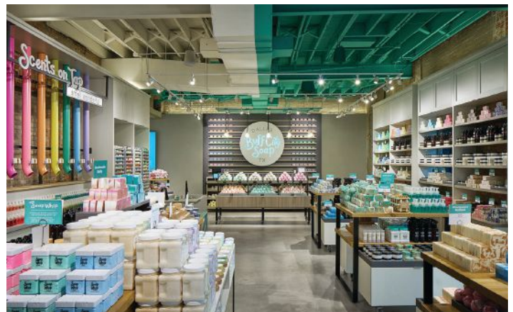
“Buff City Soap” CATEGORY: Hardline Specialty Store (Silver Award) | SUBMITTED BY: CallisonRTKL | PHOTOGRAPHY: Dror Baldinger