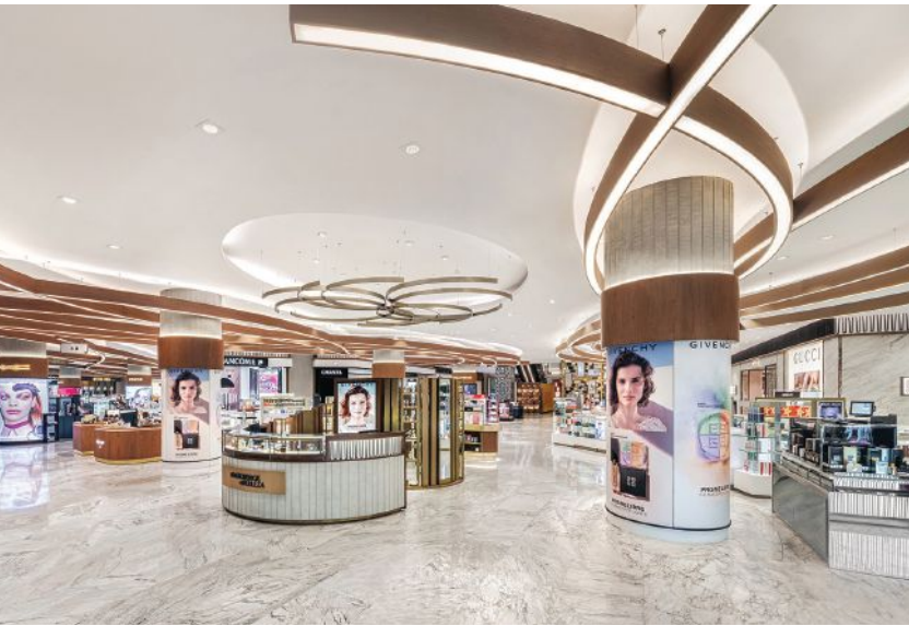
“El Palacio de Hierro Perisur” CATEGORY: Department Store (Gold Award) | SUBMITTED BY: TPG Architecture

CATEGORY: Department Store (Silver Award) | SUBMITTED BY: Jeffrey Hutchison & Associates