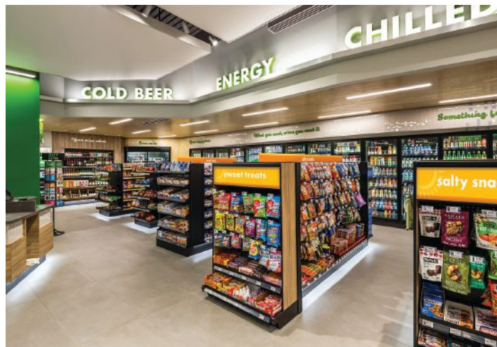
“MAPCO Prototype Design” CATEGORY: Convenience Store (Gold Award) | SUBMITTED BY: Chute Gerdeman | PHOTOGRAPHY: Seth Parker