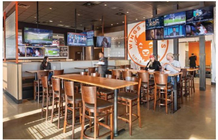
“Buffalo Wings & Rings” CATEGORY: Restaurant – Fast Food (Gold Award) | SUBMITTED BY: NELSON Worldwide | PHOTOGRAPHY: Josh Beeman