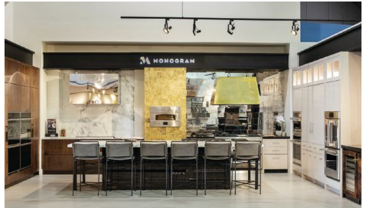
“GEA Haier Monogram and Café Luxury Showroom Kitchens” CATEGORY: Department Within a Store (Gold Award) | SUBMITTED BY: Design Phase Inc.