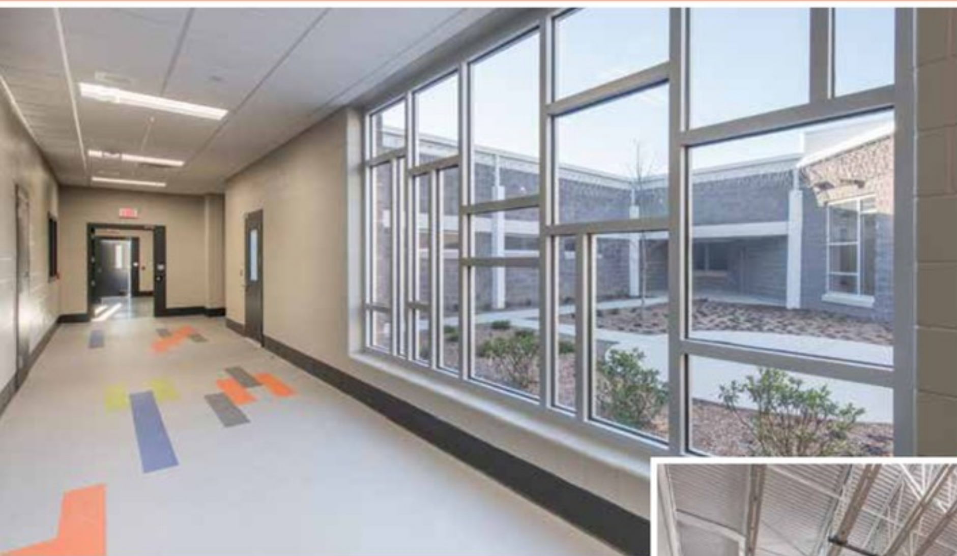
Natural light creates a warmer environment than harsh institutional lighting.