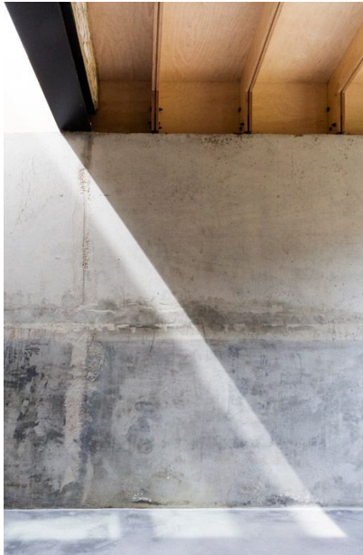
Exposed concrete continues to appeal in its use of honest architectural materials.

as exposed concrete continues to appeal in its nod to the use of honest architectural materials. This one will not go away and we are curious if the material is not taking its place as a sacred cow of architectural materials. We will know next year!