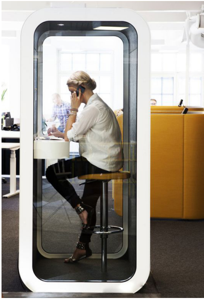
Phone booths fulfill a need in the open office for private, acoustically sealed rooms; they provide a “reservation not required” place for taking calls and conducting small video conferences

screens, double-sided flat screens, ultra-thin bendable flat screens, motion walls, and interactive video experiences to convey brand and to provide a sense of space. Many clients are investing in ultra-thin bendable flat screens and using them as event and welcome signage, as they can be relocated effortlessly in the workplace.