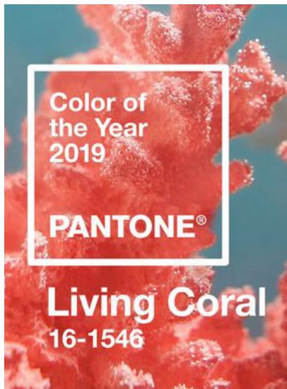
Pantone has selected Living Coral as 2019's Color of the Year.